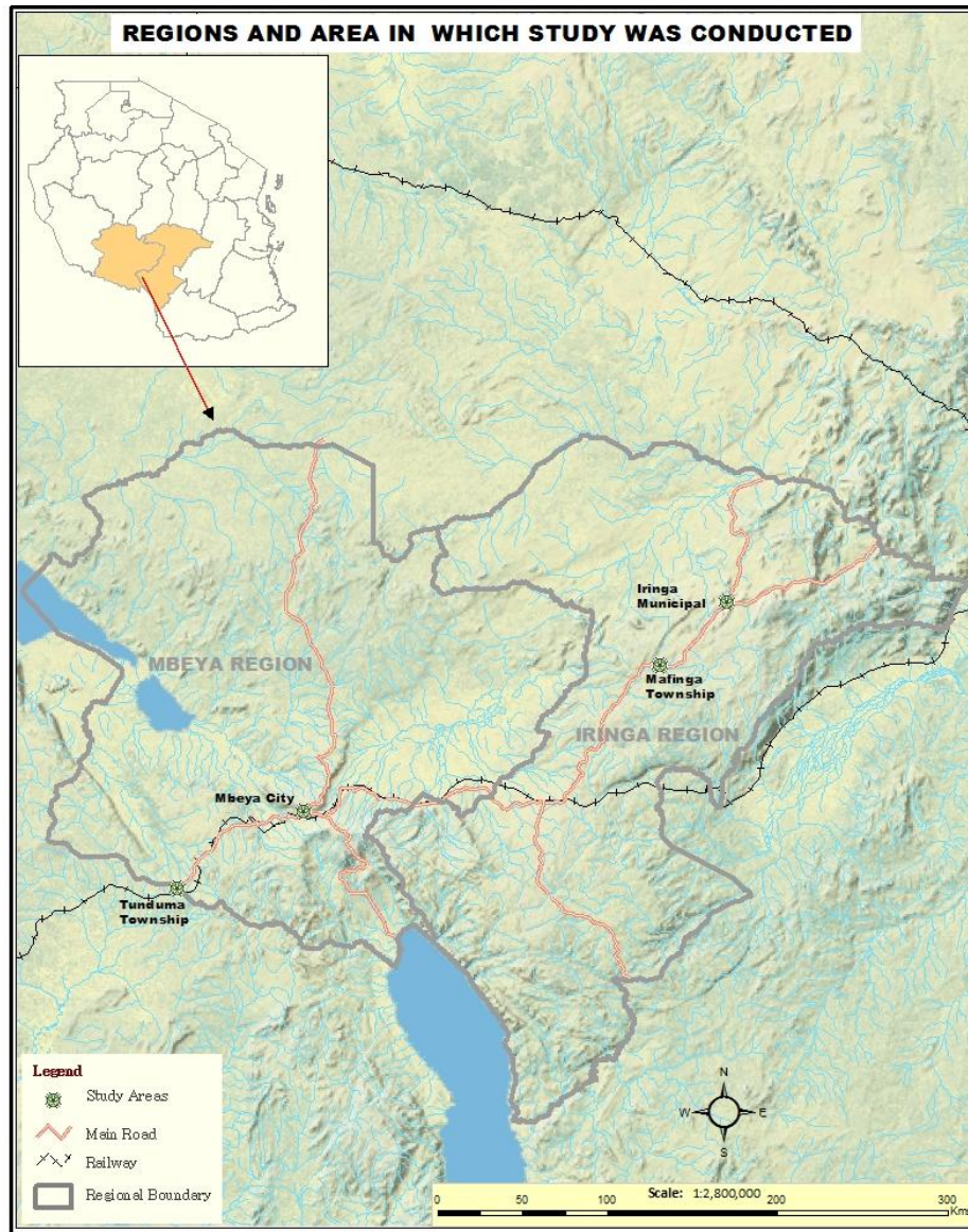
Figure 1. Map of Iringa and Mbeya Regions with the specific study areas.

meat-on-bone (Mchanganyiko) cut basis, while the price for finished beef was suggested on the same basis by key informants who were prominent beef dealers and cattle finishers in Iringa and Mbeya Regions.